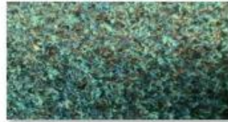
✓ 3rd place - Crabtree farm