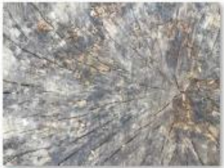
✓ 1st Place -Old Baseford

Winners chosen by the world famous artist Willard Wigan and exhibited at the Nottingham Playhouse.