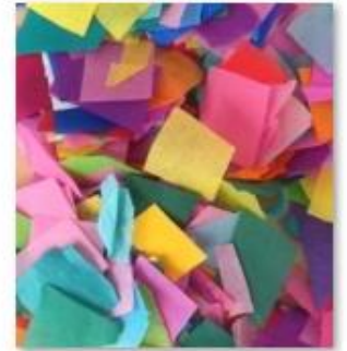
✓ 5th Place HHELC