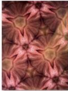
✓ 2nd place Rosehil class 10.