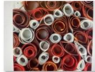
✓ 4th Place - Rosehill class 10